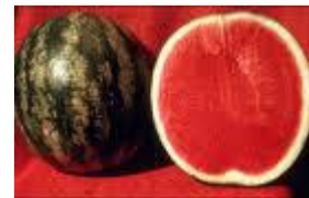
A seedless watermelon; same flavour, less hassle

Again, various products have various requirement and one needs to do quite a bit of research to figure out what the time is that the embryo is big enough to grow out but still alive as well. At some point the live little embryo starts to disintegrate and by than it is already too late to rescue the poor little plantlet. Seeing that the products are often only available in a certain period of the year, the development of the technique might take some years; however these products are often in breeding programmes that take years, so from that point of view... it is not a train smash if we get delayed a little bit!