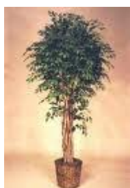
Ficus benjamina ; most likely from tc