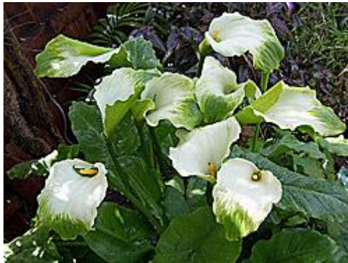
A green variation of the white Z. aethiopica