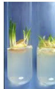
Embryos in a tube